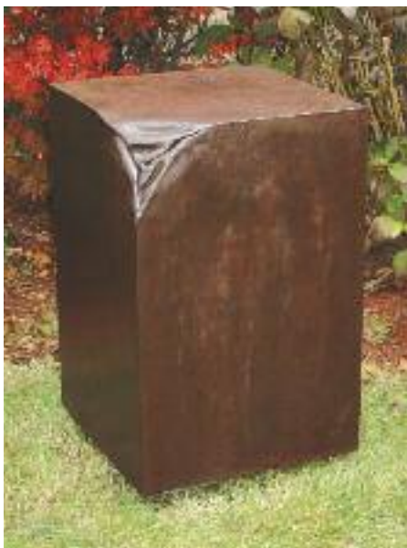
30" x 20" x 20" with dent

With patterns and textures reminiscent of the natural environment evident in his work, we can think of no better place than LongHouse Reserve to exhibit it.