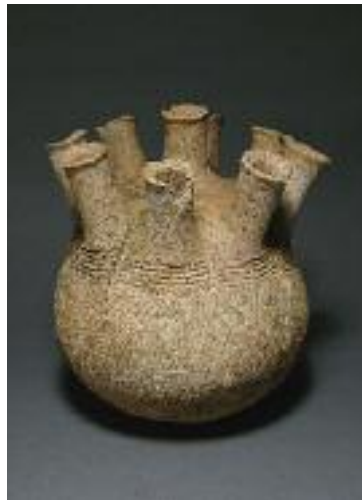
Beer/palm wine container, Nigeria, 20C 10" x 8"