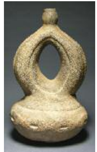
Bottle, Zande, Dem. Rep. of the Congo, late 19-early 20C 15" x 9"