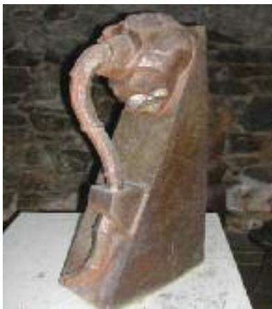
Untitled, 1991, stoneware 27" x 16" x 10"