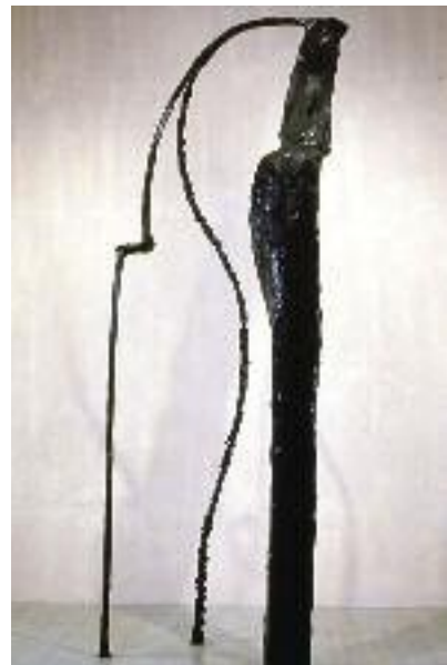
Conductor II , 1982, bronze h. 156"