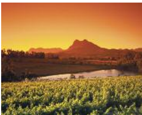
Sunset over the vineyards in South Africa