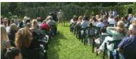
Students and parents at last year's Student Annual award presentation.

Did you know that more than 2,000 East End students visit LongHouse each year? Led by experienced docents, their individual class tours fire imaginations, support curricular objectives, and provide students the opportunity to interpret their visit through the performing, applied, or fine arts. Using LHR sculpture and gardens as inspiration, many students—K-12—under the guidance of their teachers, enter our juried Student Annual by interpreting their LongHouse experience in such areas as photography, poetry, prose, performance art, craft, painting or sculpture. The last day for student submissions is June 8th. The reception for the Student Annual III winners will be held on