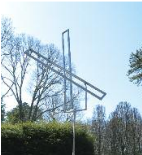
Two Open Rectangles Excentric V , 1975-76 stainless steel 152" x 39", max. 145"

George Rickey understood intrinsically, that "the second half of the 20th Century would belong to technology."