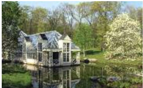
The conservatory at Stonecrop Gardens