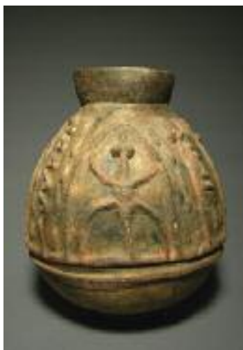
Vessel, Baatonu (Barbi), Benin 20c 17" x 13"