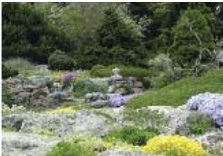
Alpines at Stonecrop Gardens