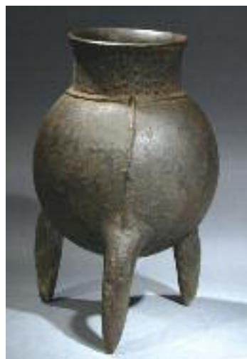
Cooking vessel, Kridi/Chamba culture, Nigeria 20c 17" x 10"