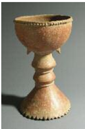
Vessel, possibly Mali, 20C 17" x 11"

As our world becomes more automated, the necessity for preserving these artifacts and the ancient traditions they represent becomes more and more critical. LongHouse is honored to showcase this collection.