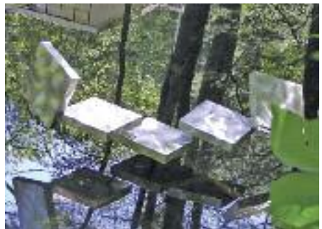
Horizontal Column of Five Squares Excentric , 1993 stainless steel 14 ¼" x 89 ¼", max. 43 ½"

George Rickey understood intrinsically, that "the second half of the 20th Century would belong to technology."