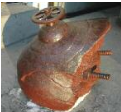
Untitled, 1993, stoneware 17" x 18" x 13"