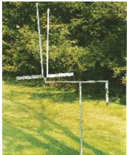
Triple L Excentric Gyrotory Gyrotory , 1979 stainless steel 152" x 39", max. 145"