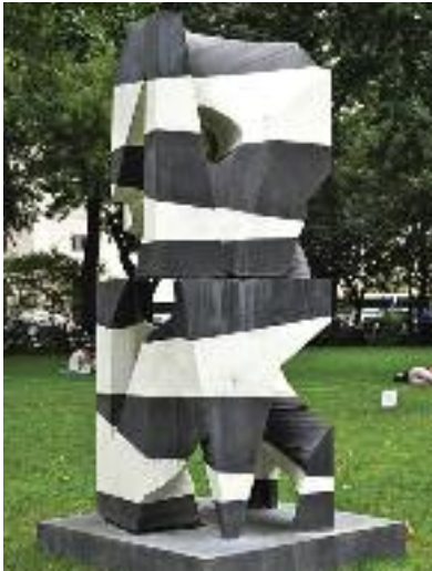
Marker , 2009 cast concrete 110" x 41" x 43"