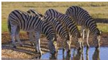
(above) Yellow protea in Kirstenbosch botanical garden, Cape Town, South Africa