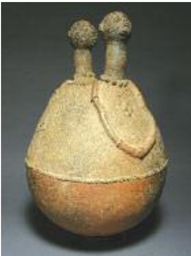
Ritual vessel, Nigeria, 20C 12" x 11"